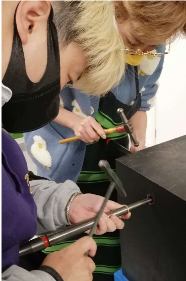
Concentrating on making just the right texture on their gold rings.