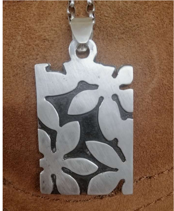
Featuring: Sterling silver "Flower tag pendant by Toni Luxton