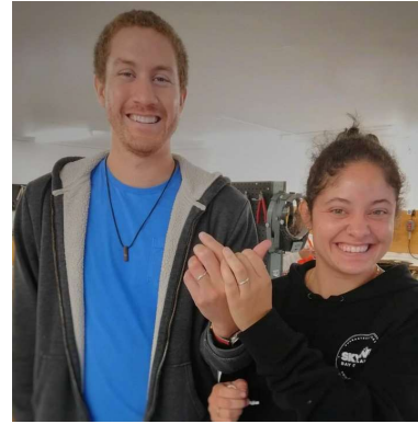
Ready to say "I do"