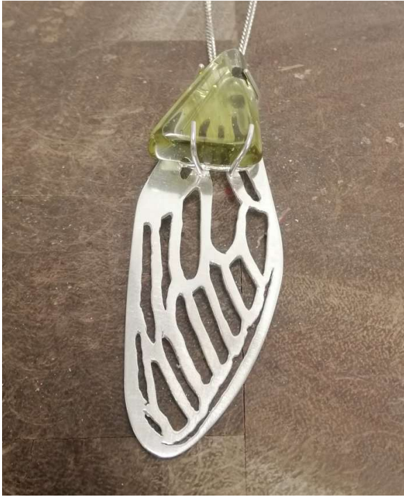
Featuring: Sterling silver Butterfly pendant by Caitlin Ingleton